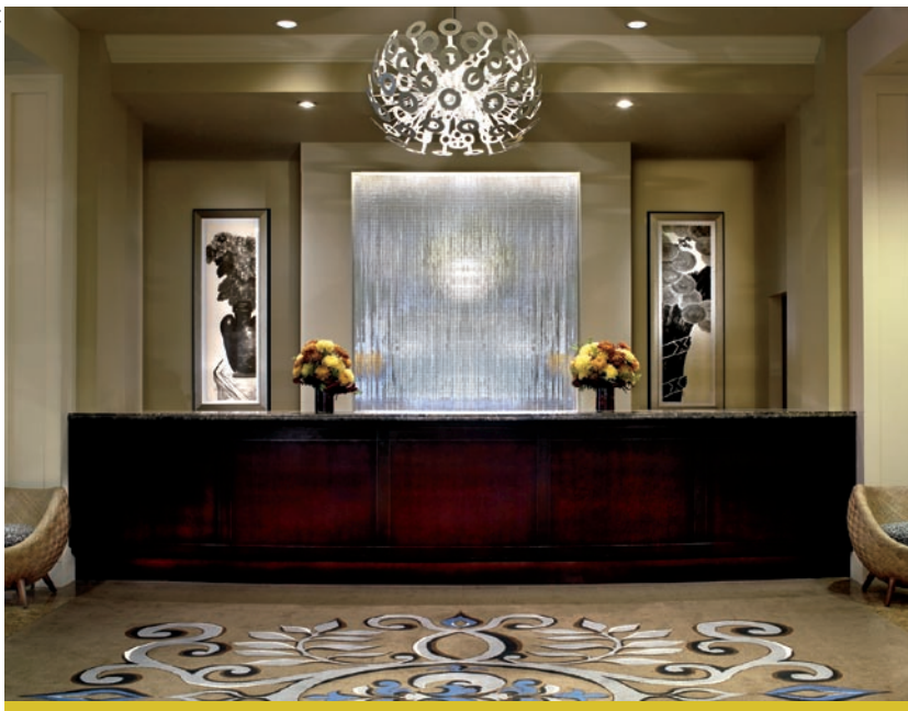
DAVID PHELPS (2)

"We're a certified Built Green hotel," she stresses.