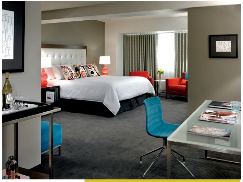
Above: Tacoma's modern and stylish Hotel Murano—named for the famous Venetian glass-blowing island—even has handblown-glass bedside lamps. Below: The inviting lobby at the renovated Alexis Hotel in downtown Seattle.